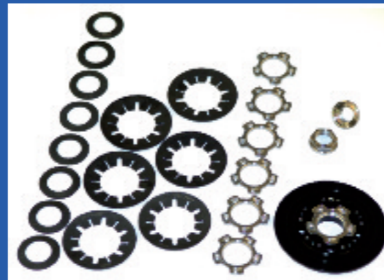
Extensive parts enable optimal tuning and adjustment.